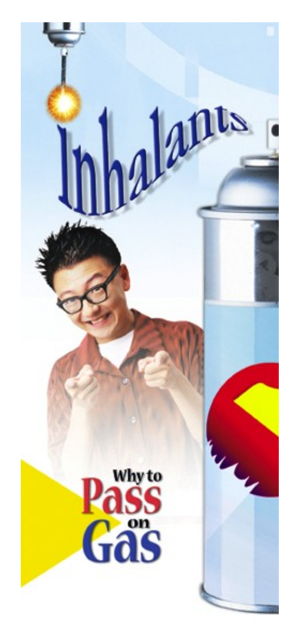
What Is Petrol (Gasoline)?